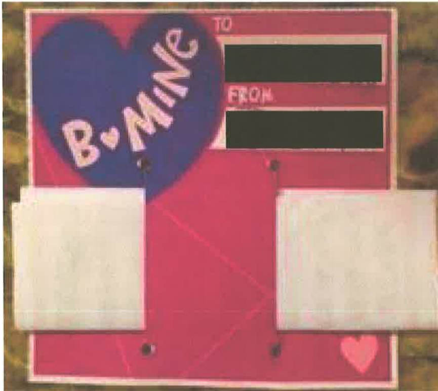
Picture of J.A.'s final Valentine's Cards with insert (names redacted)